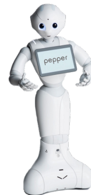
Figure 1.2: Softbank / Aldebaran Pepper

With a 180 degree turn in Human Robot Interaction, the Social Standard Platform League (SSPL) takes robots away from the traditional passive servant role, for now the robot is the one who will actively look for interaction. From a party waiter in a home environment to a hostess in a museum or shopping mall, in SSPL look for the next user who may require its services. Hence, this league focuses on Human-Robot Interaction, Natural Language Processing, People Detection and Recognition, Reactive Behaviors, and Safe Outdoor Navigation and Mapping.